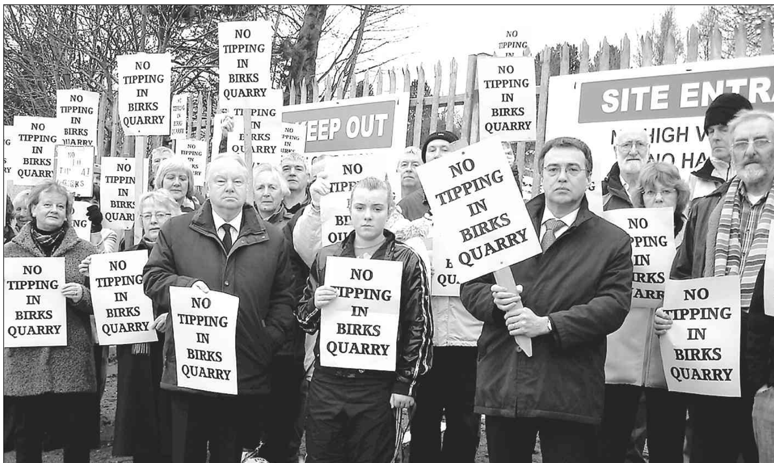
ACTION stations . . . protesters outside the quarry entrance with MP Phil Woolas